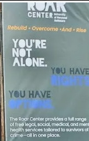
The Mitchell Law Center 1239 Druid Avenue