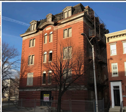
Proposed Future Home of BEYA Hall of Fame 1313 Druid Avenue