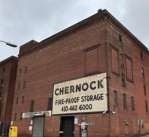
The Chernock Storage Facility 524 West Lafayette Avenue